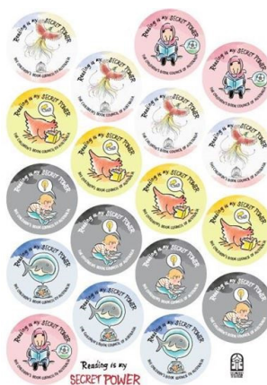
Stickers – Themed artwork 18 per A4 sheet. 50mm in diameter

Become a member and save. Simply download a membership form wa.cbca.org.au/wajoin.htm