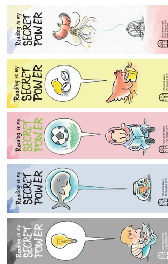
Bookmarks – Note: Order will include all five designs.