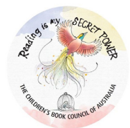
Badge – Single or bundle of 10