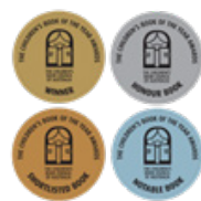
Award Stickers – Set of 4, 1 each of Winner, Honour, Shortlisted and Notable, 35 per sheet