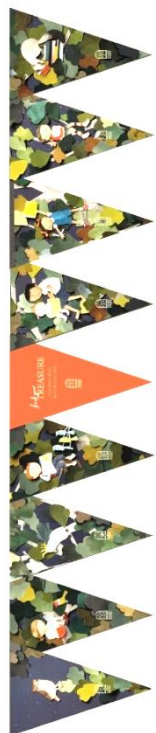
Bunting – 9 double sided flags, 2.6m length