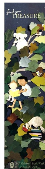
Bookmarks – Shortlisted titles on reverse, 30 minimum order