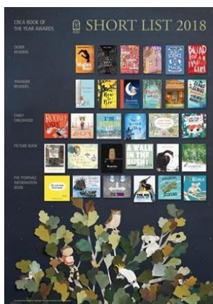
Short List Poster – Covers of all shortlisted books – A2 size