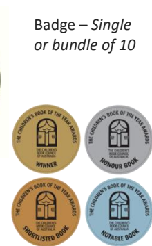
Badge – Single or bundle of 10