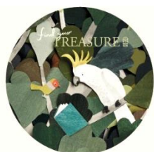
Award Stickers – Set of 4, 1 each of Winner, Honour, Shortlisted and Notable, 35 per sheet