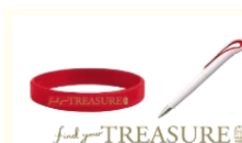
Wrist Band – Silicon, red with metallic gold printing, one size Pens – White with red themed detail