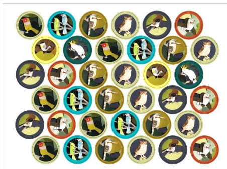
Stickers – Themed artwork 36 per A4 sheet

Become a member and save. Simply download a membership form wa.cbca.org.au/wajoin.htm